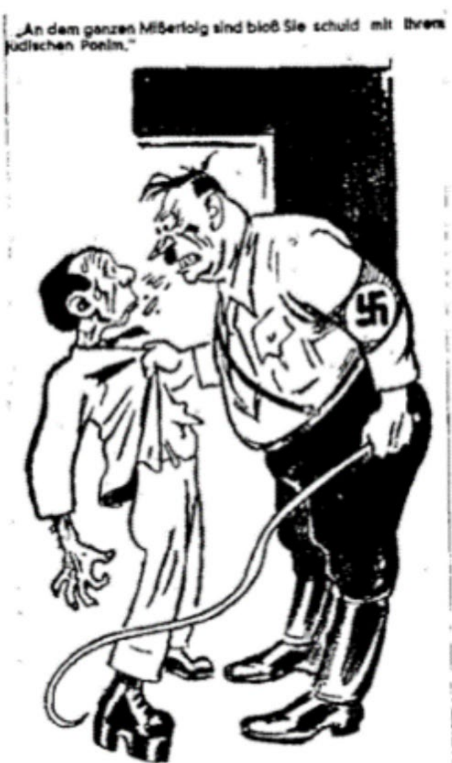
DR. JOSEPH GOEBBELS KARİKATUR: AUS: DIE ENTE / 20. NOV. 1932.