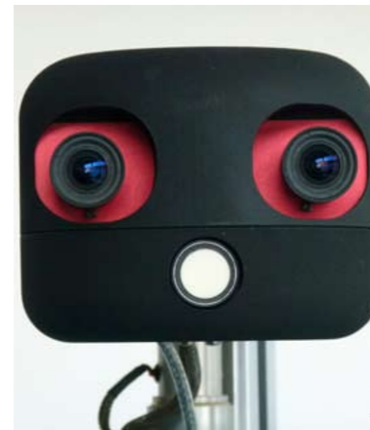
Illustrations: SFB/TR 8

This raises a number of fundamental questions: do test subjects notice that this environment is anomalous? And how do they cope, for instance, when asked to perform spatial tasks such as identifying the shortest route between a given destination and a starting point?