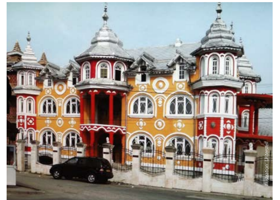
A vacant “gypsy palace” in the village of Huedin, in the district of Cluj, Romania. The Romani mainly work as “service nomads”, travelling from job to job instead of from pasture to pasture. They work as gutter makers, tin-platers and smiths.