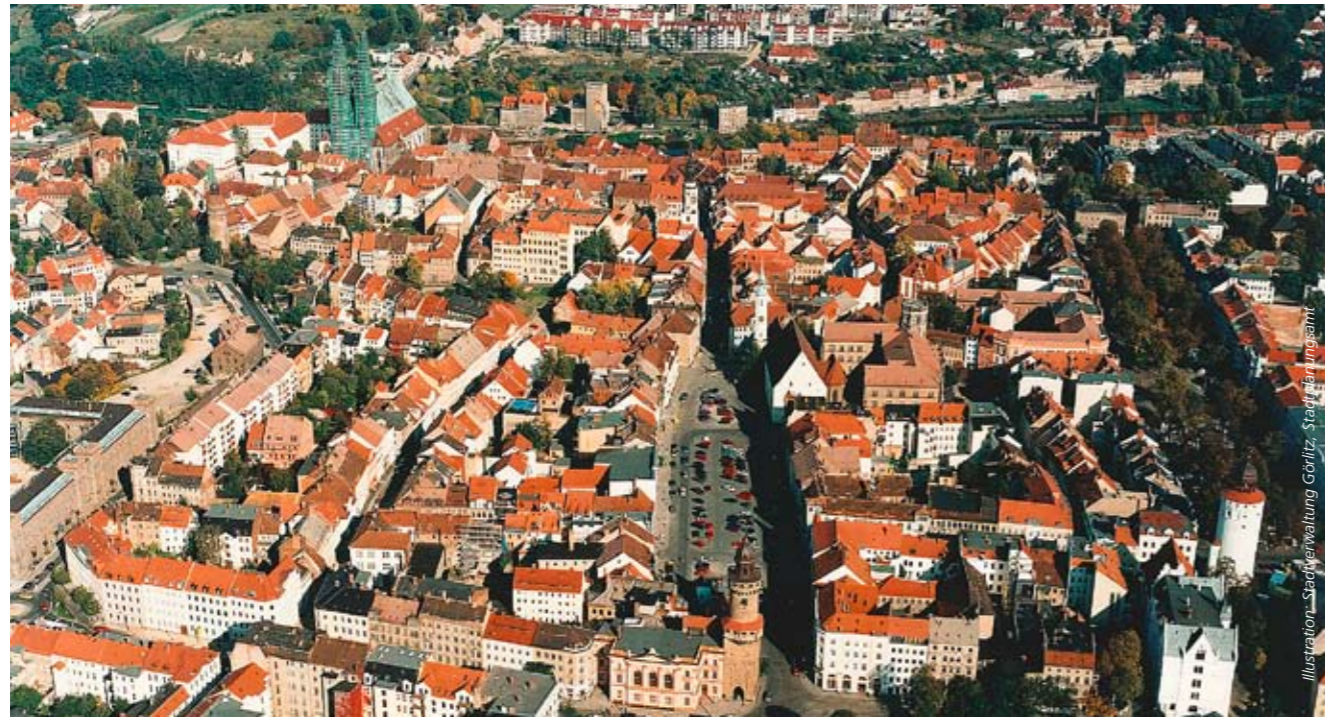
A bird's-eye view of Görlitz: The historic boundaries of the city's crowded Old Town are still visible.

the Czech Republic and Germany. Their contributions to the stories of the towns studied cover issues pertaining to the settlement, transport and economic geography of each town and its hinterland. In addition to written sources, their work is based on a series of (partly unique) maps and aerial photographs. These have been scaled to 1:25,000 and date from key years around 1830, 1900, 1940, 1975 and 2000. They are taken from the map collections belonging to the Herder Institute in Marburg and the cooperation partners involved.