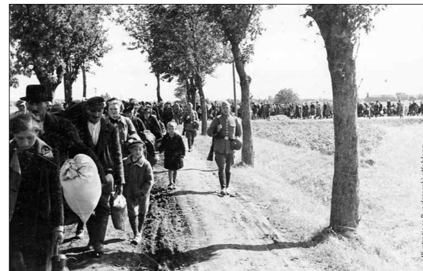
Illustration: Bundesarchiv, Koblenz