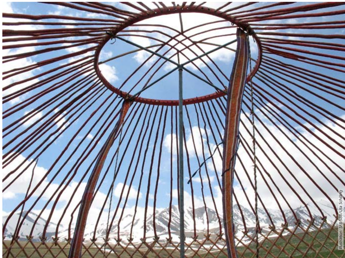
Illustration: SFB 586/Uta Schilling