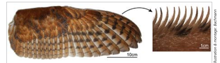
Illustration &amp; montage: Bachmann

The stereo information comes about from the fact that the eyes are laterally separated in the head. The scene is therefore projected on