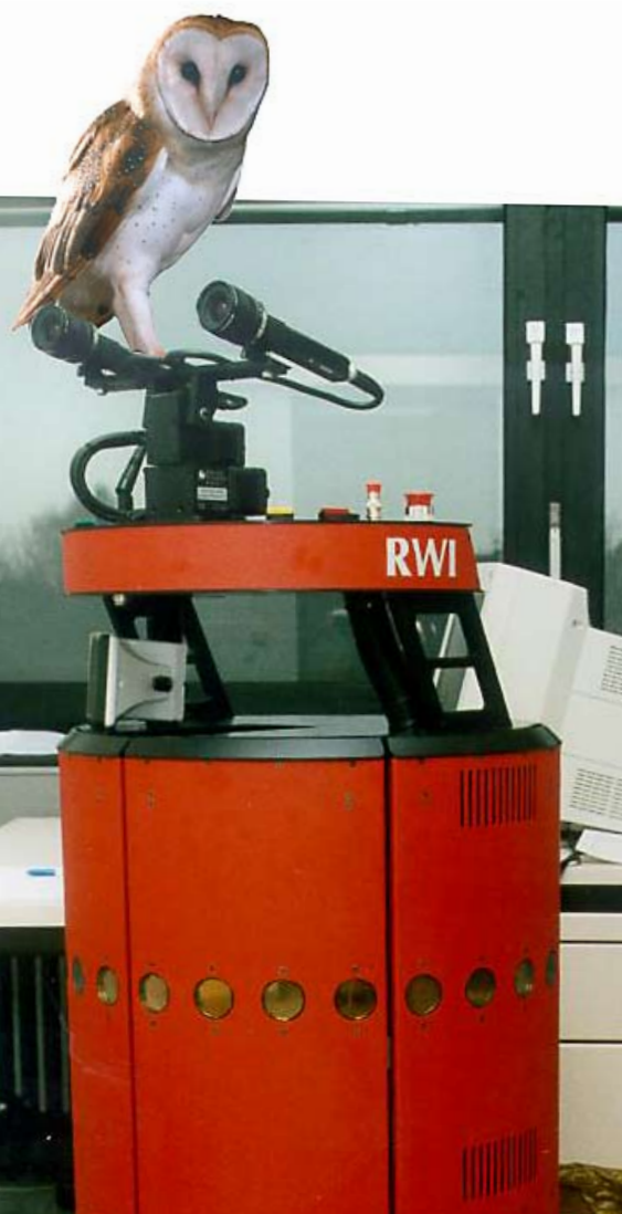
The barn owl has an astounding sense of hearing. The facial ruff collects sounds and acts like an amplifier.

For hunting in twilight, the barn owl mainly uses its highly specialised hearing. The ruff collects sounds in a similar way to a parabolic dish, and acts as an amplifier. This allows the bird to hear sounds that are ten times quieter than the quietest sounds perceptible to humans. A crucial role in this is played by the outer ring of ruff feathers, which is made of a dense border of stiff, sound-reflecting feathers. The interior of the ruff, by contrast, consists of finely barbed auricular feathers (from the Latin auris = ear), which due to their structure are “transparent” to sound and relay it to the ears with virtually no attenuation. Work has therefore begun on simulating the ruff, to obtain clues which may help in improving the spatial resolution of directional microphones, for example.