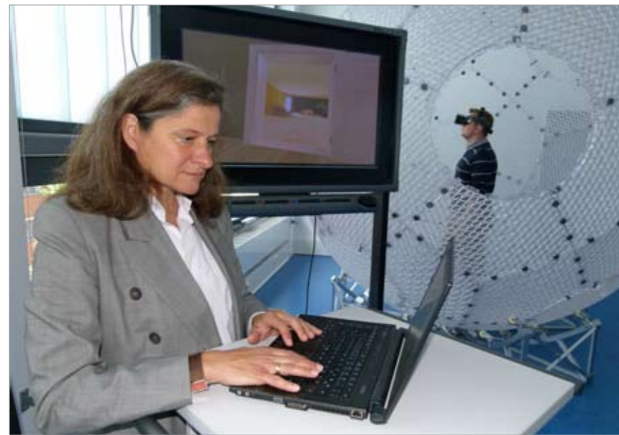
Left: Data generated by the VirtuSphere is transmitted to the researcher's monitor. Right: The research findings will help in the development of robots with cognitive abilities similar to humans. The robot in this image is equipped with a spatial cognition system.

and there are no noticeable bridges or tunnels. According to the physical laws that hold sway in our real world, these two corridors should intersect at some point. And yet they never meet in this man-made virtual world.