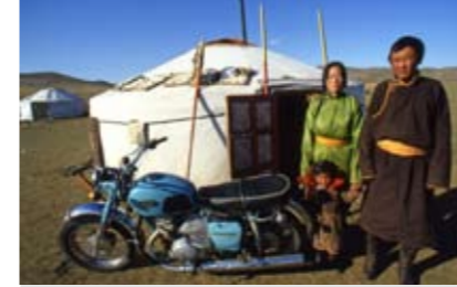
Everyday life in Mongolia: The "Encounters of Significance" exhibition in Hamburg's Museum of Ethnology provides thought-provoking insight on nomadic lifestyles.

Nomads: Wanderers in a Settled World | The Essence of Research: From an Idea to Knowledge | Mobility: The Secret Life of the Commuter | Urban Studies: Reborn from the Spirit of Europe | Science Communication: RoboBee and Friends | Travelling Exhibition: "General Plan East" in Poland | Spatial Information: The Hamster Wheel