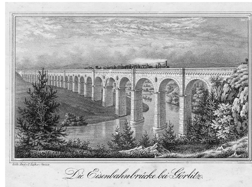
The Lusatian Neisse Viaduct, completed in 1847, was one of Silesia's largest rail bridges.

the two towns developed very differently, with their planning axes running either side of the Lusatian Neisse, from north to south.