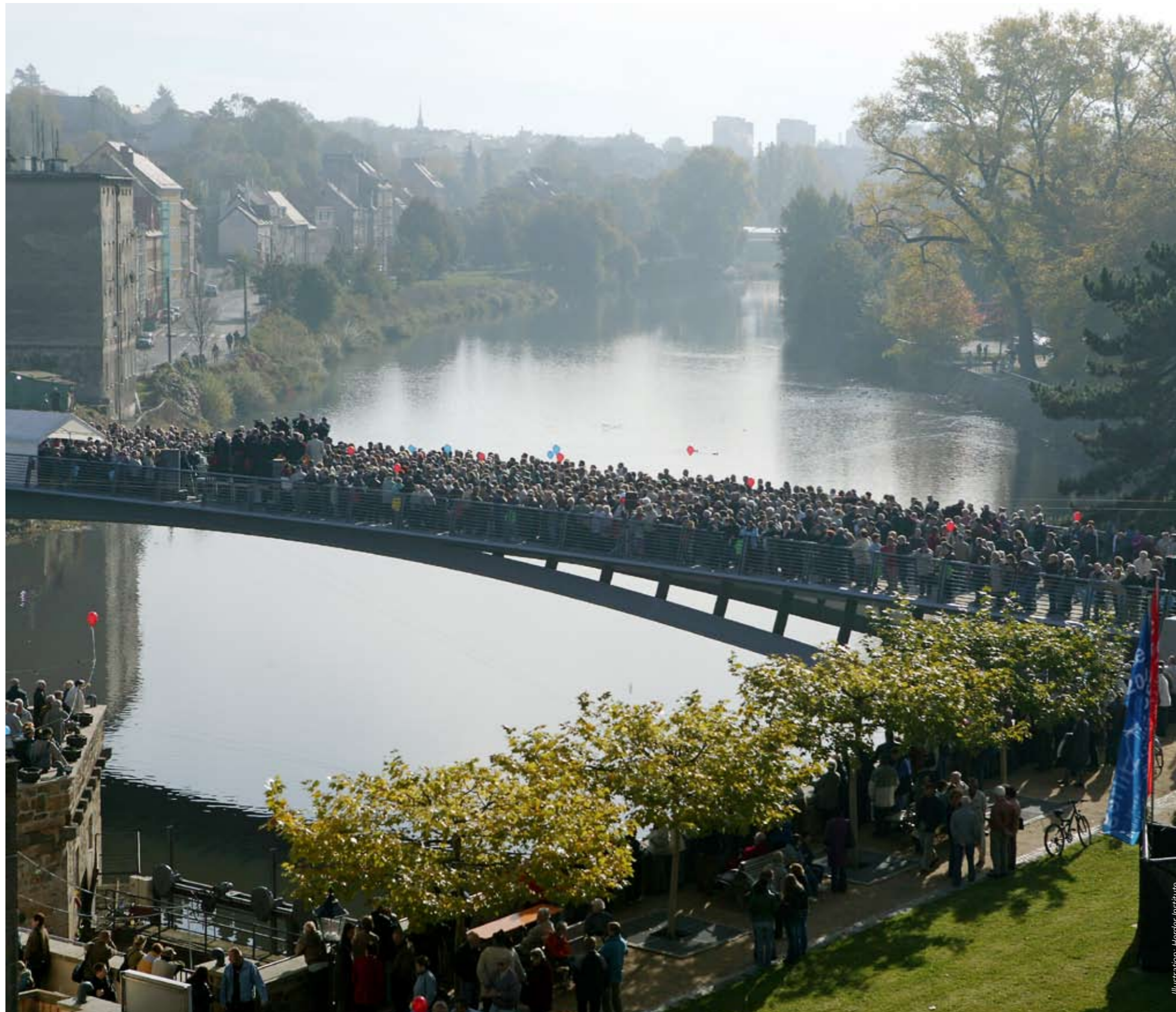
Illustration: Herder Institute