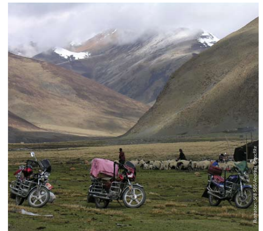
Illustration: SFB 586/Andreas Grieschke

The exhibition contains four sections: “Exchange and Trade”, “Leadership and Control”, “Nature and Animals – Work and Product”, and “Difference and Integration”. Nomadic societies arise where uncultivable deserts, steppe landscapes and