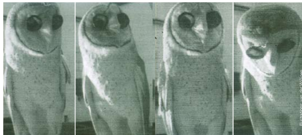
Illustrations: van der Willigen

If the barn owl with such a small head achieves equally good or even better localisation accuracy than a human being, then it must be better able to evaluate the directional information contained in the sound. The brain of the barn owl is highly specialised for processing acoustic signals. Its hearing organ is greatly enlarged in comparison to other birds. It is in the hearing organ where the arrival time of a