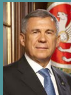
Rustam Minnikhanov President of the Republic of Tatarstan

I encourage all participants to work fruitfully, to expand the scope of business contacts and to implement all the plans. I wish you success in all endeavors! I hope that Tatarstan and Kazan will become places where you will always be glad to return!