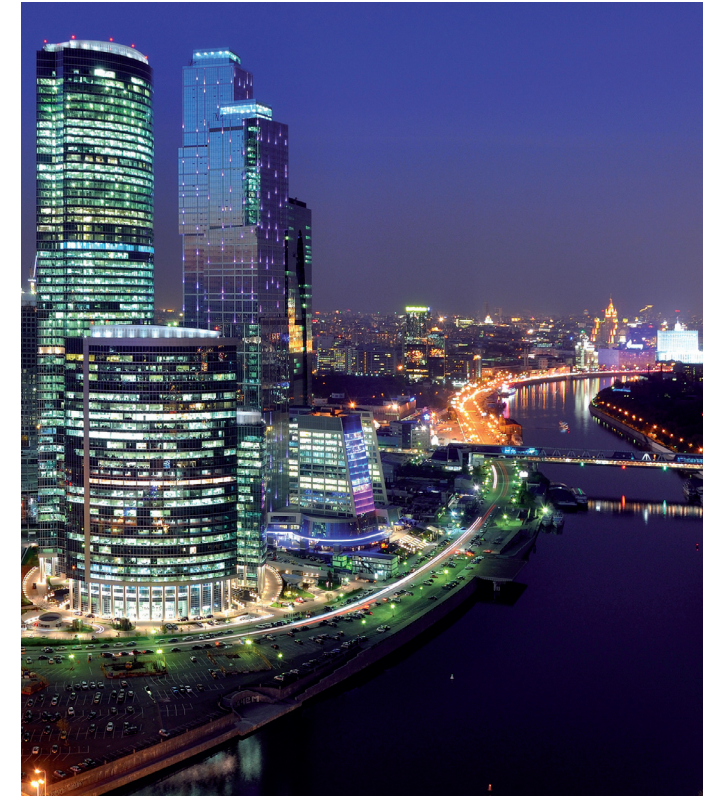
Print: Köllen Druck, Bonn; January 2012