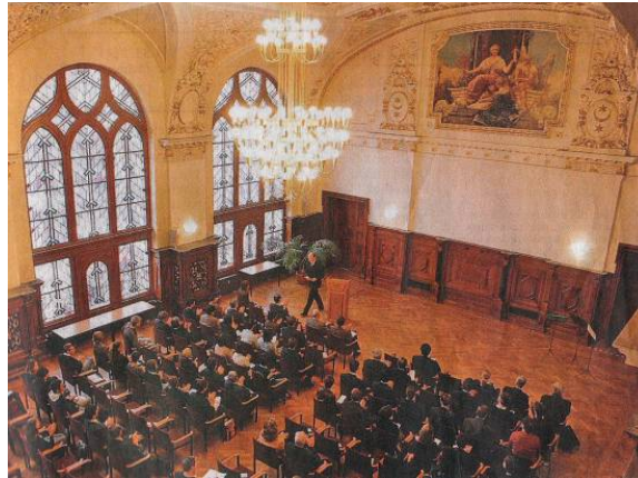
Opening Ceremony Oct 07, 2007 Halle