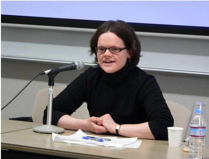
Academy, March 2009, Tokyo Presentation of Dissertation Projects