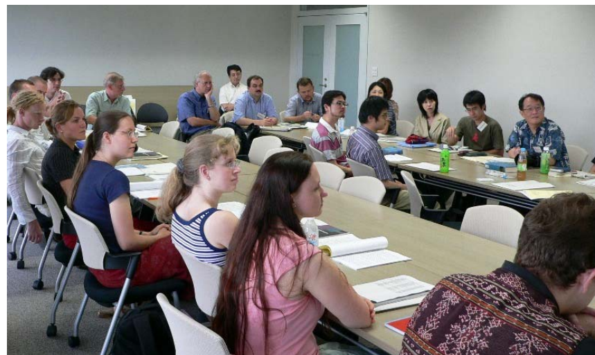
Workshop 2005, Tokyo