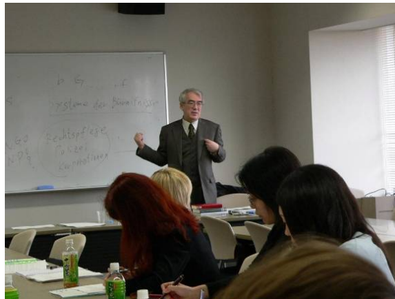
Lecture Mar 08, 2008 Tokyo