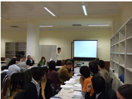
Presentation of Dissertation Project