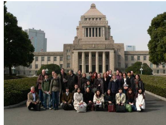
Field Trip Mar 09, 2009 Tokyo