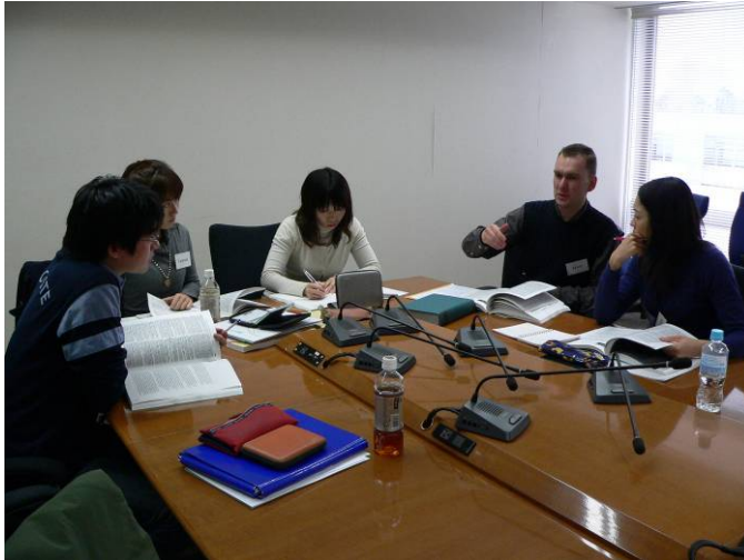
Academy, March 2009, Tokyo Working Groups