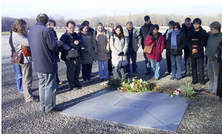
Workshop 2004, Halle